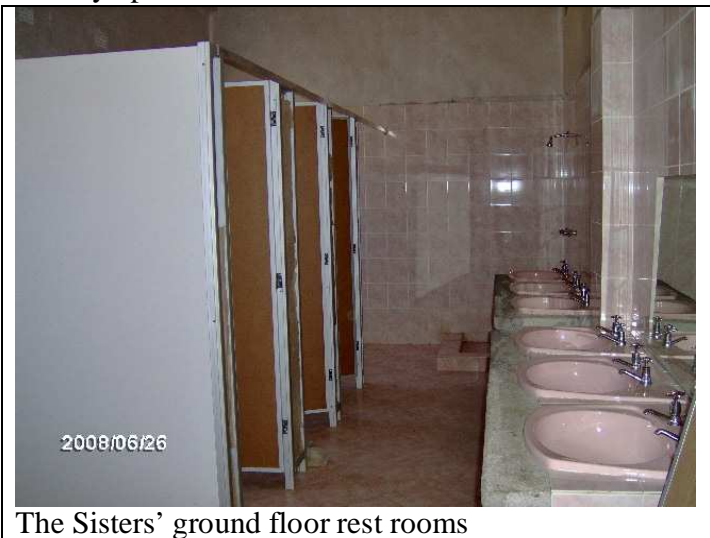
The Sisters' ground floor rest rooms

Work on the rest rooms is almost complete with a few fittings remaining but they are already operational.