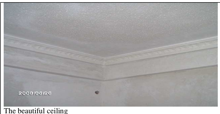
The beautiful ceiling

Window blinds have also been set-up in the offices. The ceiling has been nicely done and oil waiting to be painted.