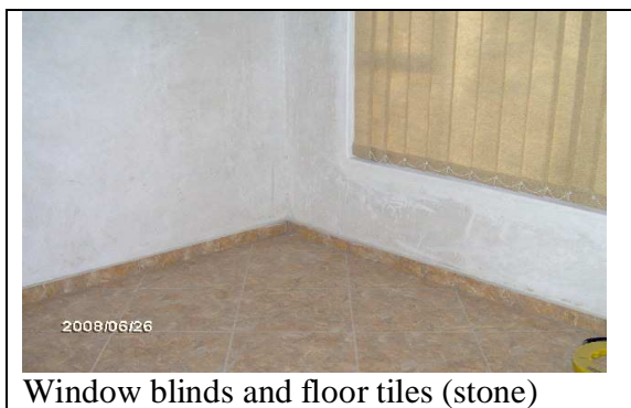
Window blinds and floor tiles (stone)

In the past month, significant progress has been registered in the offices side. The floors have been tiled with both wooden and stone tiles. The finish is quite impressive and will look excellent once polished.