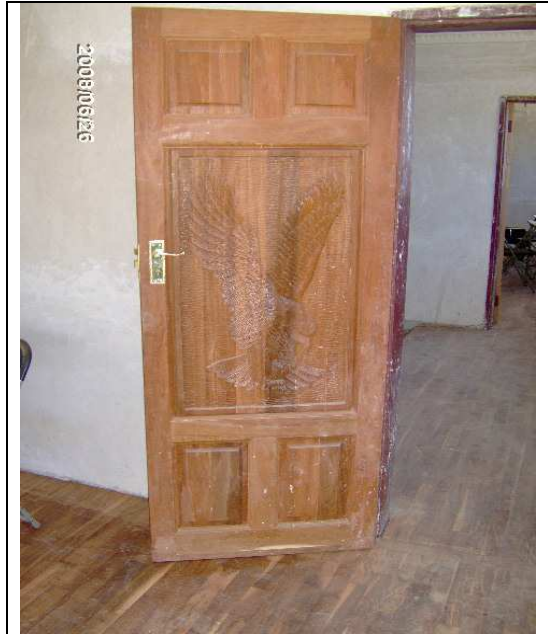
The gorgeous doors and matching wooden floor tiles

Particular pain is being taken to ensure that all fittings are of a high quality and nice looking. Look at the door to the right which is one of the doors leading to the Pastor's office with the beautiful engraving that is all too familiar to the 1980-90s back-page of the Spoken Word books.